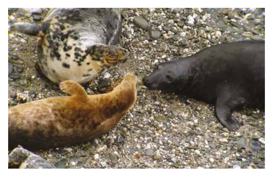
1. Male, female and juvenile seals near Godrevy